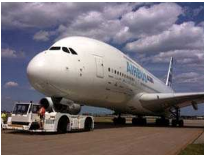
The Airbus A380 at Oshkosh 2009

Progress continues on the club house. Despite a call for a workday on the Monday after our last monthly meeting, there really weren't enough of us to do much good. Still, progress continues with some fresh paint on the floors, and some insulation and paneling on the walls. The ceiling fans were being installed and the appliances were being moved into a nearly completed kitchen. It is still going to take some good workdays to complete but at least we're starting to see the fruits of our labors.