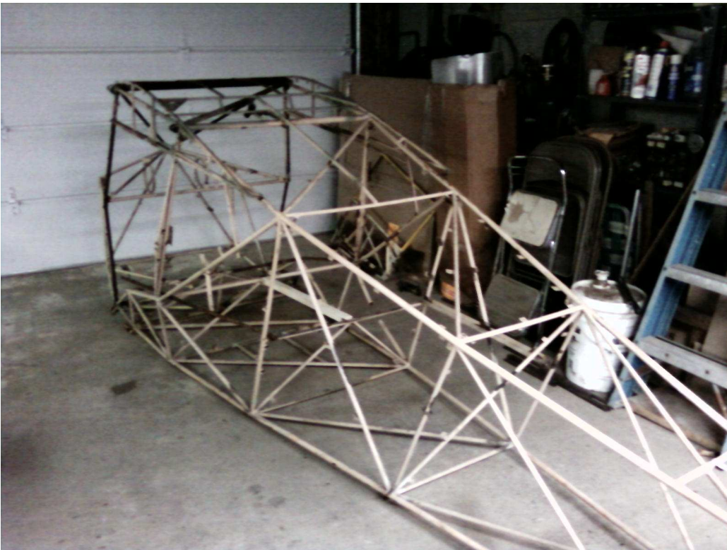
Bottom: Tim's stripped fuselage.