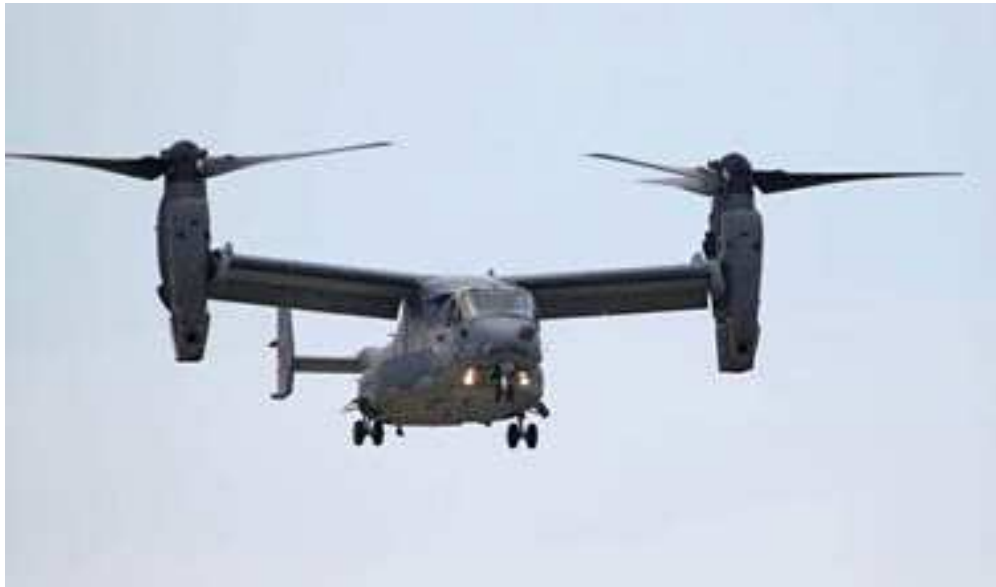
Above: V-22 Osprey comes in for a landing at Oshkosh 2010.

What do you think about social media/social networking for Chapter 827?