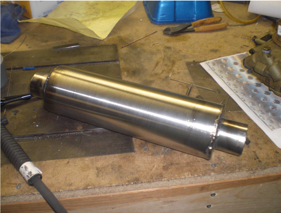
Top: The beautiful finished muffler made in part, out of a stainless steel pool ladder.

The month saw the initial fit-up of the boot cowl Produced as two sections, a left half and a right half, these large pieces of aluminum wrap around the fuselage between the firewall and the wind-screen and doors. To ensure a good fit, one half was first cut out of roofing paper and test fit onto the airframe. After making some minor adjustments to the cutouts for the tubing structure, etc. it was traced onto the 3003 aluminum sheet and cut with a hand snips.